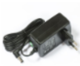
24V 1.2A power adapter

Package includes the following accessories that come with the device: